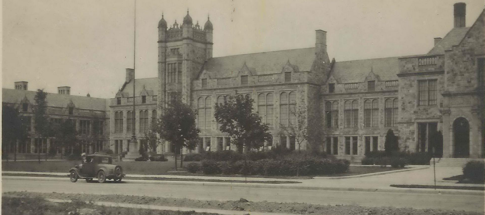
FORDSON HIGH SCHOOL